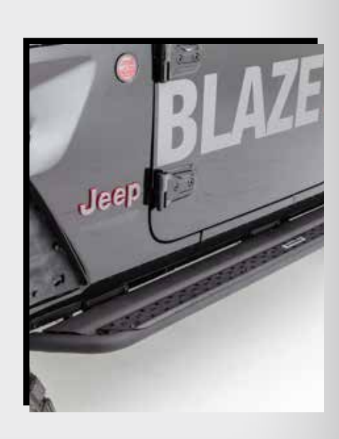
$50 eRewards Dominator DSS Side Steps