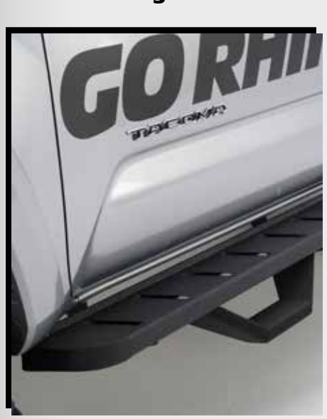
$75 eRewards RB10 w/ Drop Step Running Boards