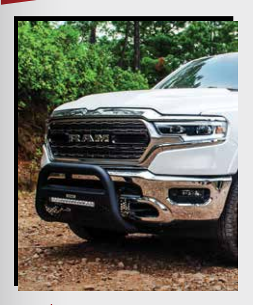
$25 eRewards RC2 LR w/ Go Rhino LED Lights