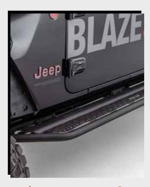
$50 eRewards Dominator D6 Side Steps