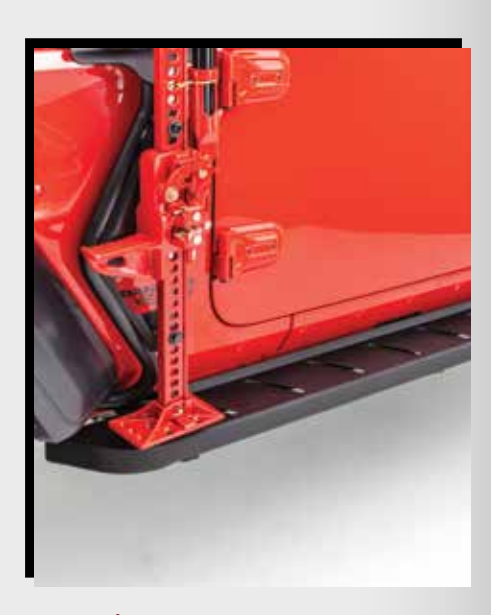
$50 eRewards RB10 Running Boards