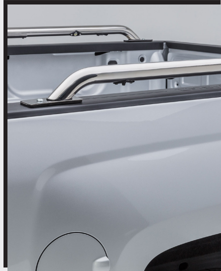
$25 eRewards All Bed Rails & LED Bed Rails