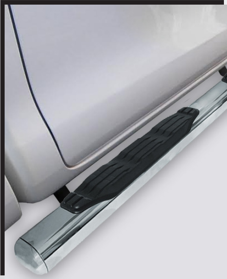
$25 eRewards All 4" & 5" 1000 Series Side Bars