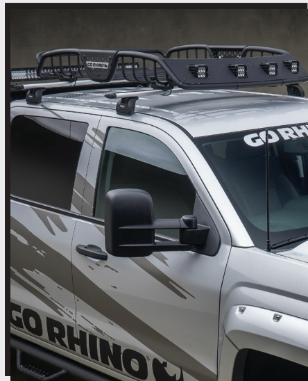
$50 eRewards All SR10, SR20 & SR40 Racks