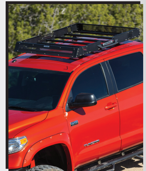
$50 eRewards All SRM100 Racks