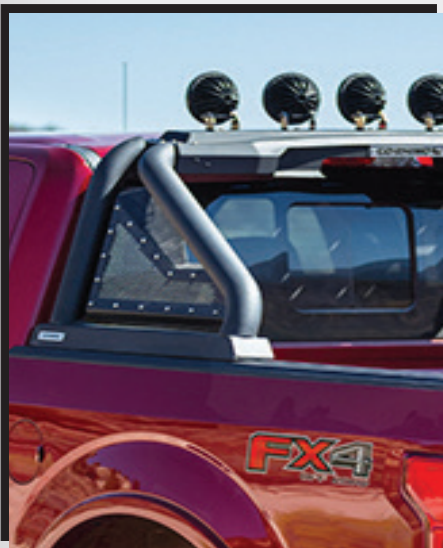
$75 eRewards All Sport Bar 2.0