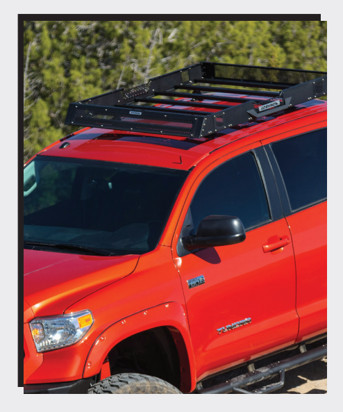
$50 eRewards SRM100 Roof Racks