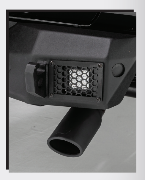
$10 eRewards Go Rhino Exhaust Tips