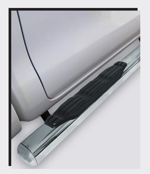
$25 eRewards 4" & 5" 1000 Series Side steps