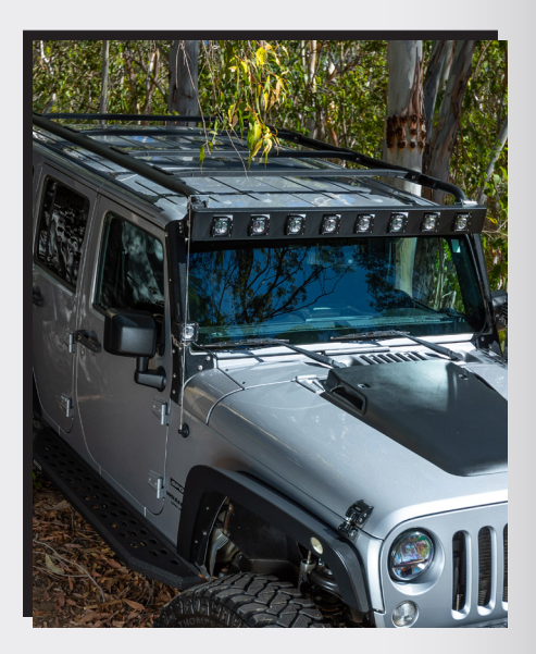
$50 eRewards Overland Roof Racks