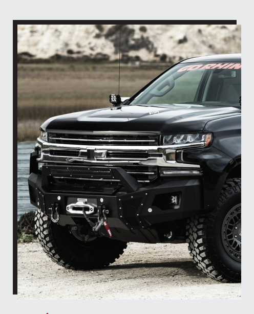
$100 eReward All Front & Rear Bumpers For Truck