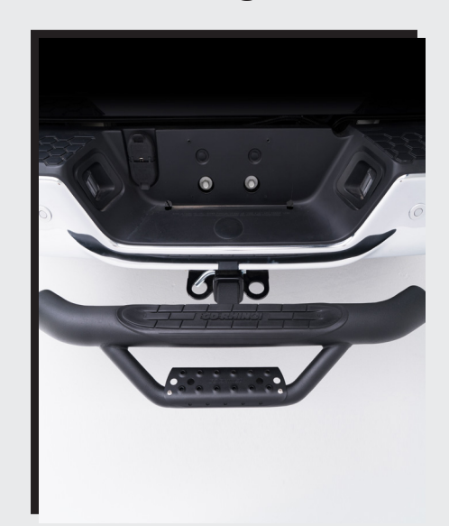
$10 eRewards Dominator Hitch Steps