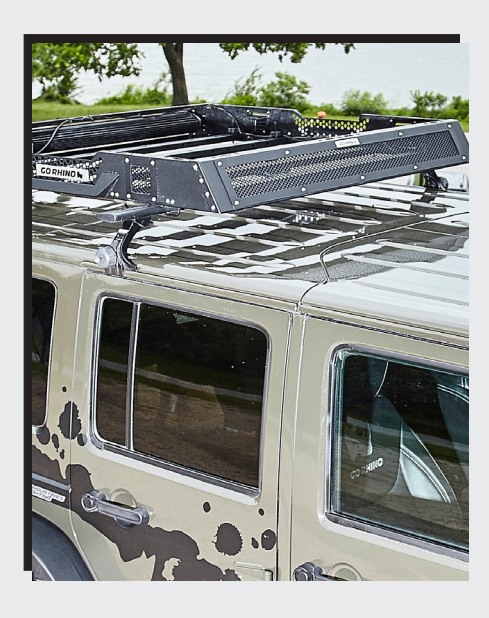
$50 eRewards SRM100 Roof Racks