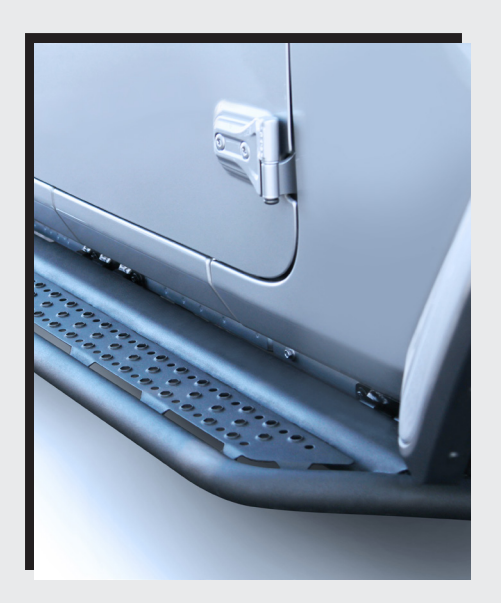
$50 eRewards Dominators Side Steps - D1, D2, D3, D4, D6, DS, DSS