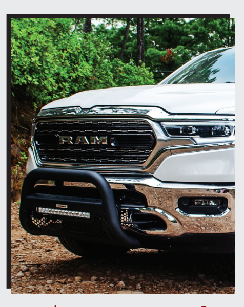
$25 eRewards RC2 w/ GR Lights 2, 4 & 20" Single Row