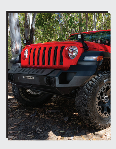
$50 eRewards Trailline Jeep® Bumpers