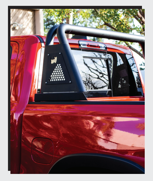
$35 eRewards Sport Bar 3.0