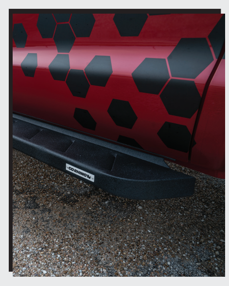
$50 eRewards RB10 Running Boards