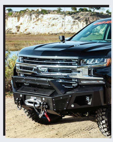
$100 eRewards BR Series Truck Front Bumpers