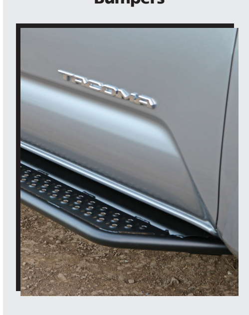
$50 eRewards Dominator D6 Side Steps