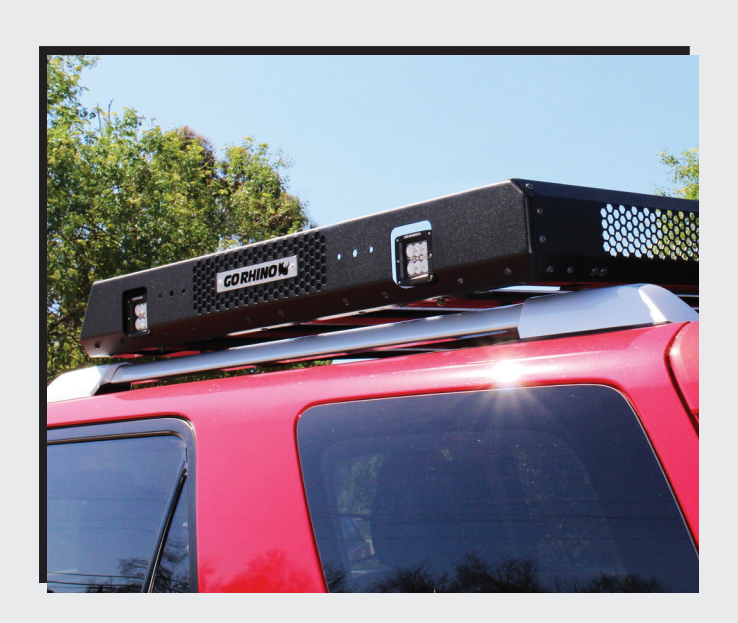
$50 eRewards SRM400 Roof Rack