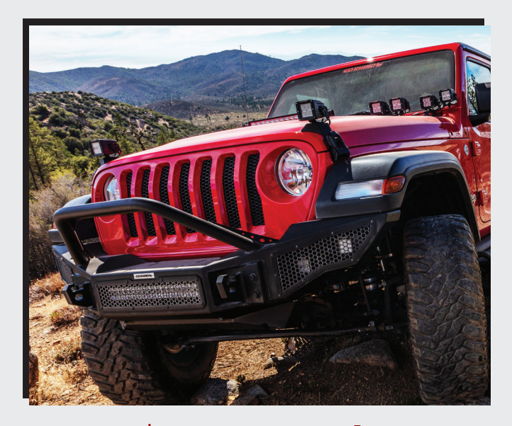
$50 eRewards Rockline Front Bumpers