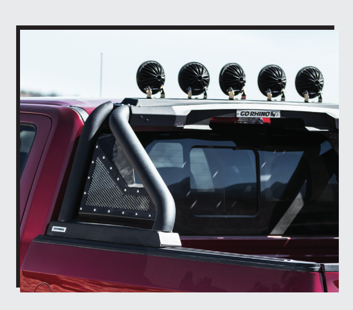
$100 eRewards Sport Bar 2.0